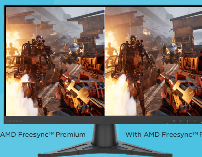
Without AMD FreeSync™ Premium

The Lenovo G24e-20 display blends economy with uncompromising performance and compelling visuals. The adjustable monitor comes with Natural Low Blue Light technology, which prevents image distortion and reduces eyestrain so you can keep on playing, working, and streaming in comfort. The 3000:1 contrast ratio displays more gray levels than standard for vivid imagery and stunning video output that gamers crave. 95% sRGB color gamut offers a wider selection of colors that allows you to see exactly what the developer intended and enhances the gaming experience.