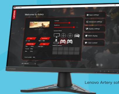
Lenovo Artery software

Loaded with multiple gaming features, the G24e powers uncompromising gaming with stunning display performance. The 100 Hz refresh rate that can overclock to 120 Hz, along with 1ms MPRT 2 ensure latency, streaking, and ghosting are kept to a minimum for instantaneous, high-quality gaming and content consumption. AMD FreeSync™ Premium technology 1 helps reduce screen stutter for significantly smoother gameplay by dynamically adjusting the refresh rate to match the GPU output, so you can always stay focused on the game.