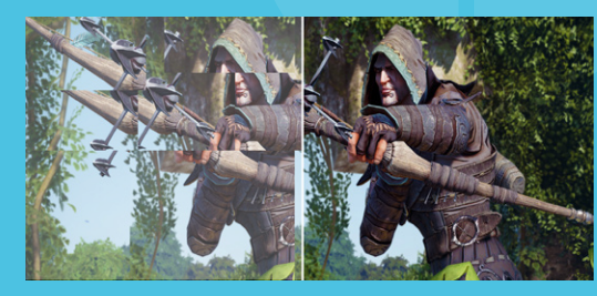
Without the VRR Technology With the VRR Technology